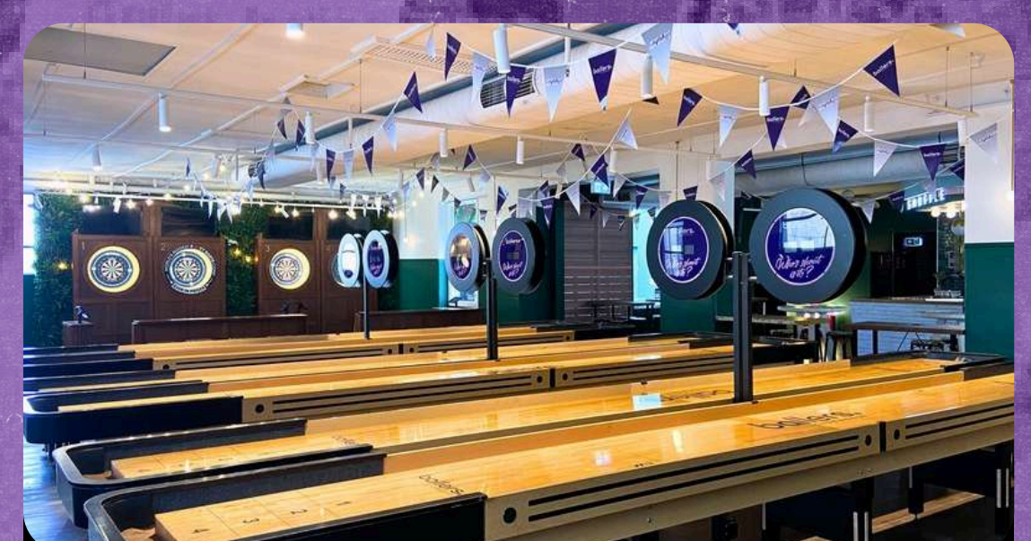
THE SHUFFLE PAVILLION