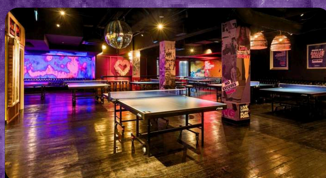
PING PONG PRECINCT