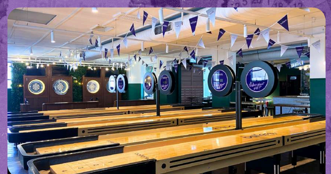
THE SHUFFLE PAVILLION