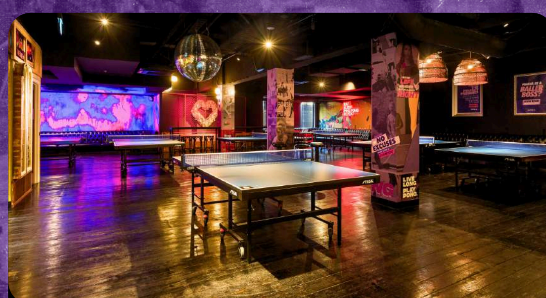
PING PONG PRECINCT